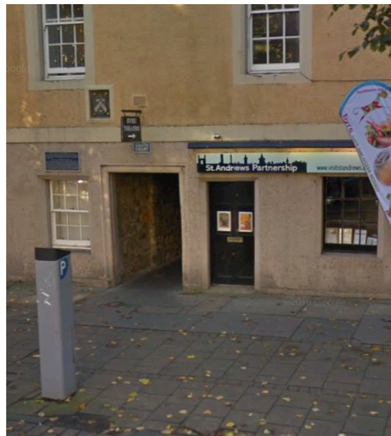
Less visible entrance to the place (South St)