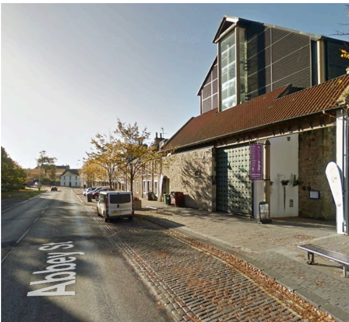
Main entrance to the Byre Theater (Abbey St)

Going up from the residence and returning to Doubledykes Road, instead of following Doubledykes, cross the street towards Argyle Street, which changes its name to South Street after passing through the medieval gate (see map). Then, follow South Street to the last crossing-roundabout before the cathedral. There are two entrances to the Byre Theatre". The main one is on Abbey St, which you get to by turning right and walking downhill from that last crossing-intersection. The less visible entrance is on South Street itself, an entryway by a sign reading in a "St Andrews Partnership", which leads to an alley that then leads to The Byre. As shown on the map above, one route ends in the middle of the block where the entranceway is, and another ends at the main entrance on Abbey St.